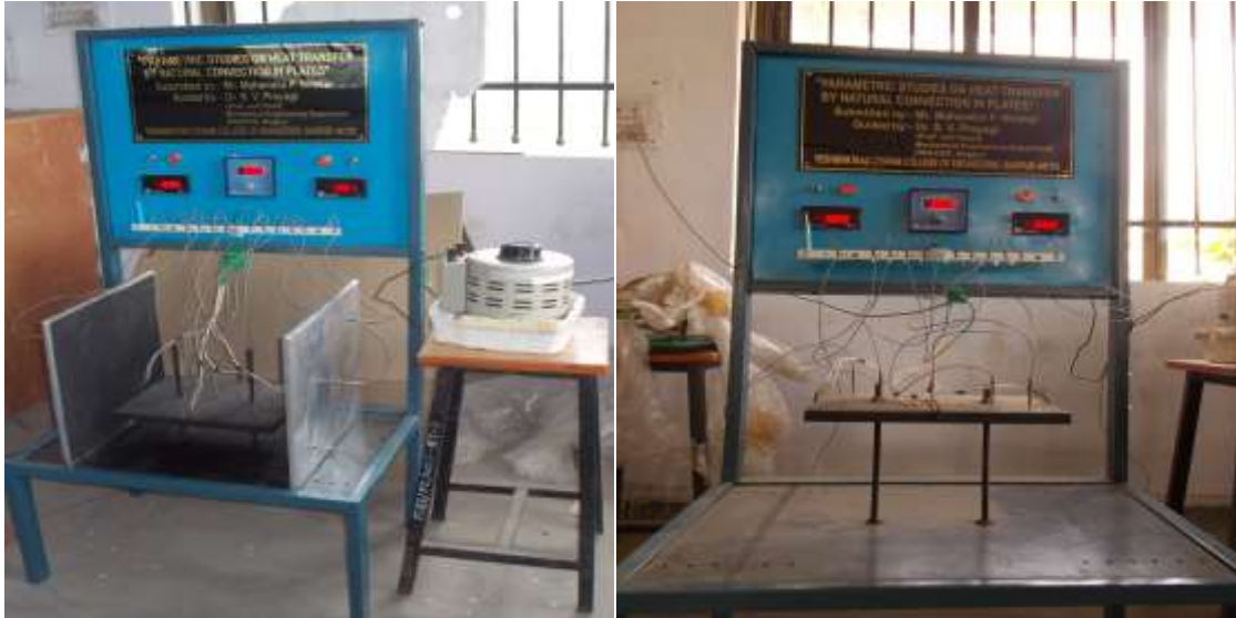
Fig1- Experimental set-up with and without vertical confining walls.

The experimental set-up consists of following instrumentation –